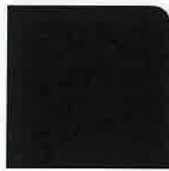
SATIN BLACK GN150A

Careful design considerations ensure the system seamlessly integrates providing a complete aluminium balustrade suite that is easy to assemble and install in either core drill or base plated application without requirement of welding.