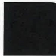
MONUMENT MATT GL229A