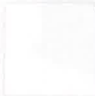
PEARL WHITE GLOSS GA078A